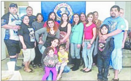
Lending helping hands: Members of San Diego CNMI Club host a gathering for medical referral patients during the holidays.