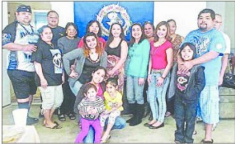
Lending helping hands: Members of San Diego CNMI Club host a gathering for medical referral patients during the holidays.