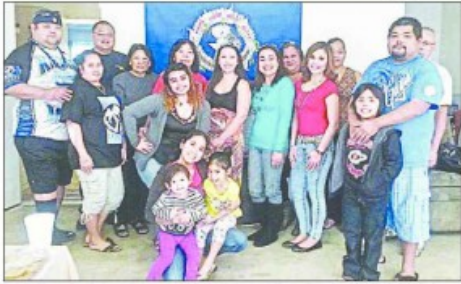
Lending helping hands: Members of San Diego CNMI Club host a gathering for medical referral patients during the holidays.